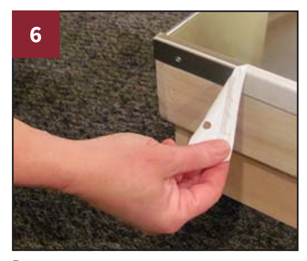
Remove tape After your ironing center is installed remove protective tape from brackets.