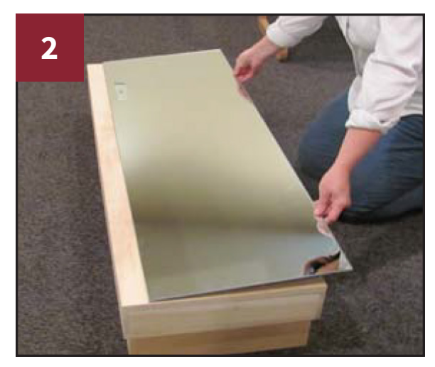
Lay mirror on unit

Before beginning installation, inspect mirror for possible shipping damage.