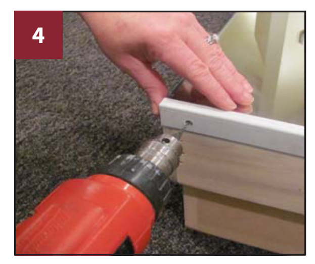
Pre-drill holes Pre-drill a pilot hole into each screw using a 5/64 drill bit.