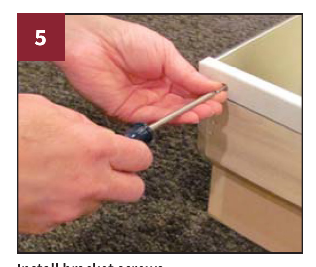
Install bracket screws Drive small wood screws into each hole located on bracket. Your mirror is now installed and unit is ready to be mounted or recessed.